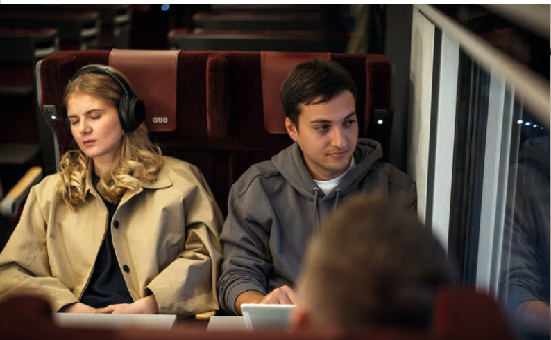
Open seating car

A couchette compartment for 4 to 6 people is ideal for groups, families or cost-conscious solo passengers . There is no gender separation, but dedicated ladies' compartments can be booked.