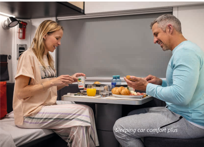
Sleeping car comfort plus

The services offered on and coach composition of EuroNight trains and other railway companies may differ from the offering presented by ÖBB Nightjet.