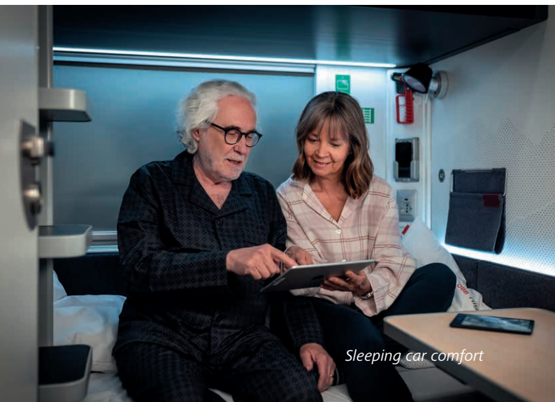
Sleeping car comfort

The services offered on and coach composition of EuroNight trains and other railway companies may differ from the offering presented by ÖBB Nightjet.